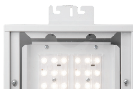
Integrated surface mounting brackets make installation very easy.