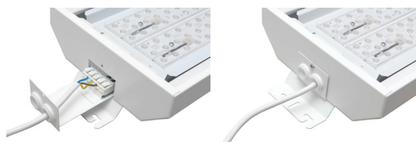
The pull-out connection strip speeds up installation.