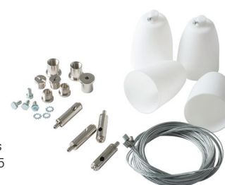
Wire suspension kits 4107113 and 4146595 as accessories.